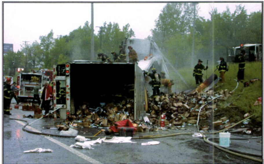
The victim was pinned under the truck.